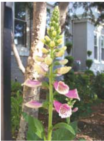
A foxgloves' petals perches upon the peeling bark of a Kousa dogwood