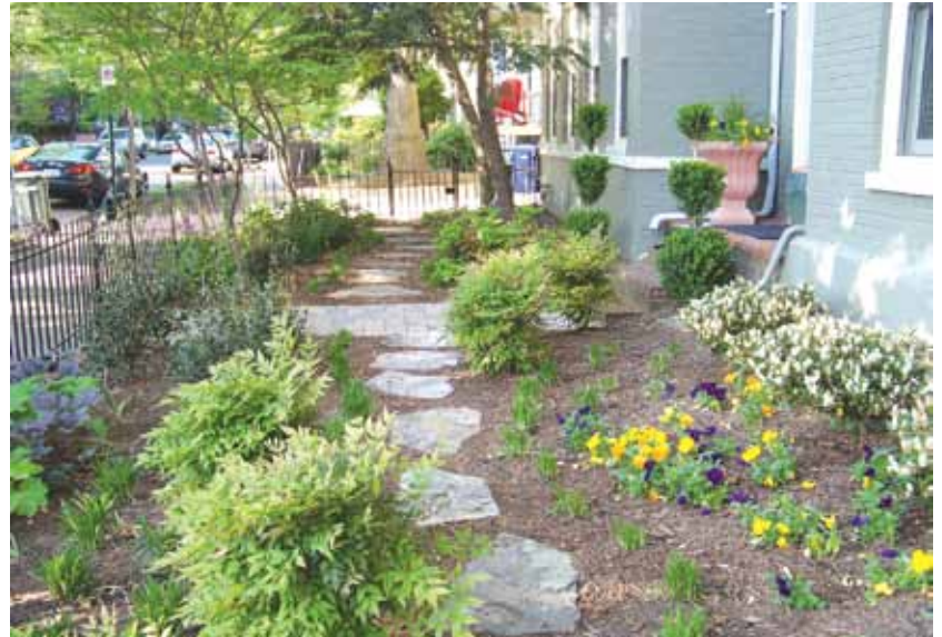
After the garden flows and drifts through its many microclimates