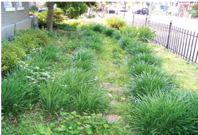
Before the seas of liriop overpowered even the harsh cement pavers

As the garden continues along 11th Street, the sun fades away behind the shade of mature hemlocks, dogwoods and hollies. The street trees assist in transforming the harshest western exposure into a shaded oasis where moss and lichens would be perfectly, unexpectedly at home. The spaces were originally landscaped with masses of liriop