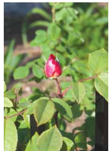
A rose frolics along the restored iron fence

Over the next month the drawings and plans came together, the brick walkway to the main entry and the broken up cement driveway gave way to European inspired pavers. The seas and seas of lirioppe were tamed and repurposed into the tree boxes. Iron hair-pin tree box fencing was added, and the massive amounts